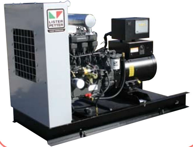
GS Series Open Set Shown

Prime Power: Continuous power rating with 10% overload available for 1 hour in 12 hours of operation.